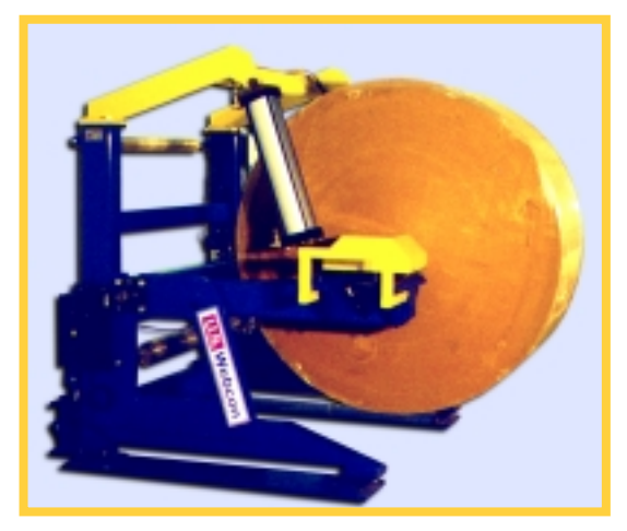
The pictures show a shaftless unwind with fixed width pedestals, transducer roll control cluster, pneumatic brake and pneumatic cylinder roll lift mechanism.

The Skyhook series can be further customized to meet your production needs